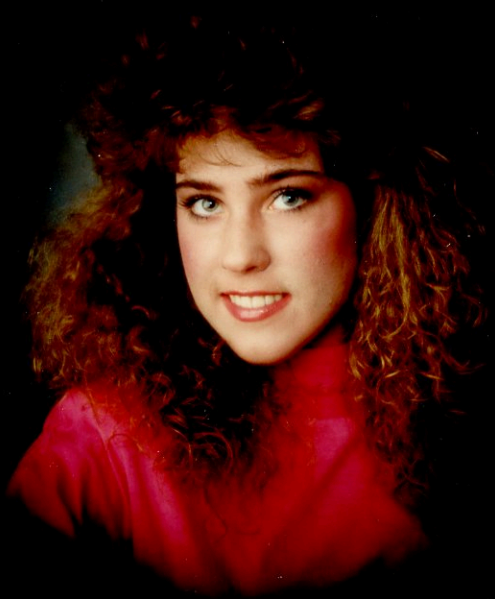
Actual Photograph using: Sailwind Leon LVK Vignette