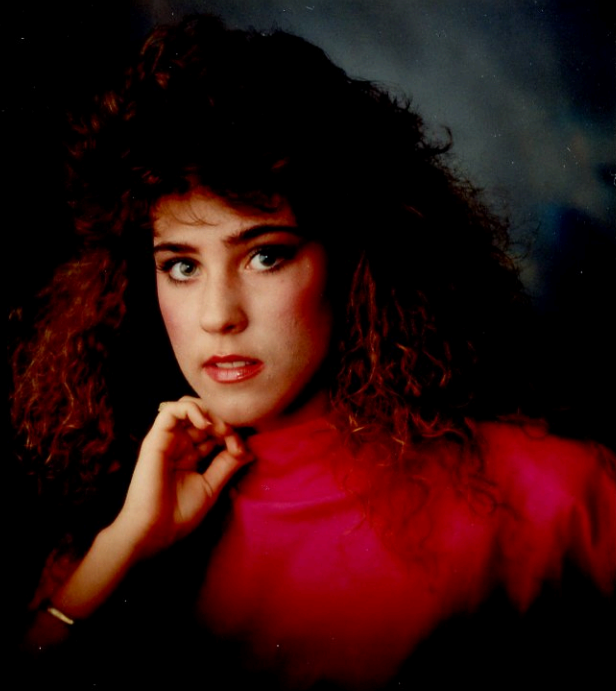
Actual Photograph using: Sailwind Leon LPS Vignette